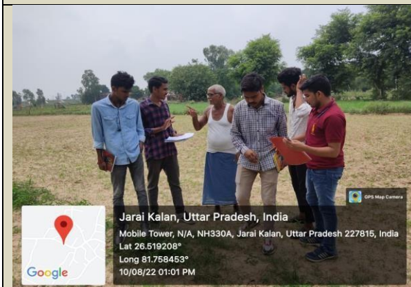
Students working in field during rural awareness welfare programme on 10.08.22