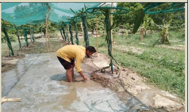
Ph.D students working on research project in field on 03.08.2021