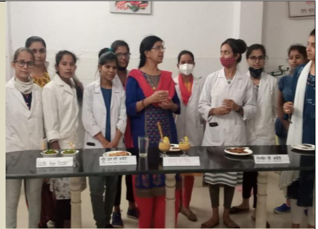
Demonstration of meal planning in food service Lab on 21.10.21.