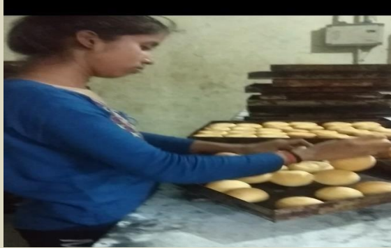
Student of Community Science learning to use multi layered fabric cutting machine at hosiery under course In-Plant Training on 03.09.17