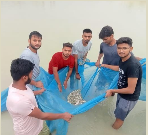
Carp fish spawn rearing at instructional fish farm by students on 18.05.2021