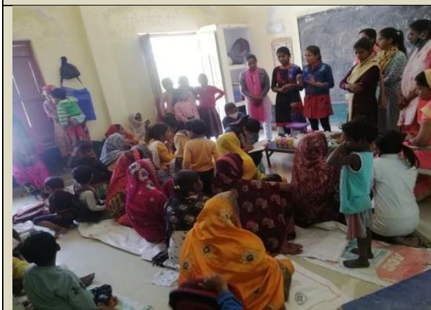
Students working in village under course Rural Agricultural Work Experience (RAWE) on 03.01.2019