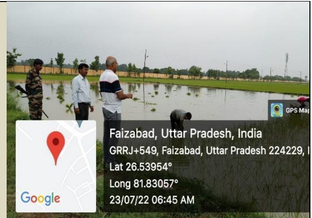
Students at Instructional farm for Practical Crop Production on 23.07.22