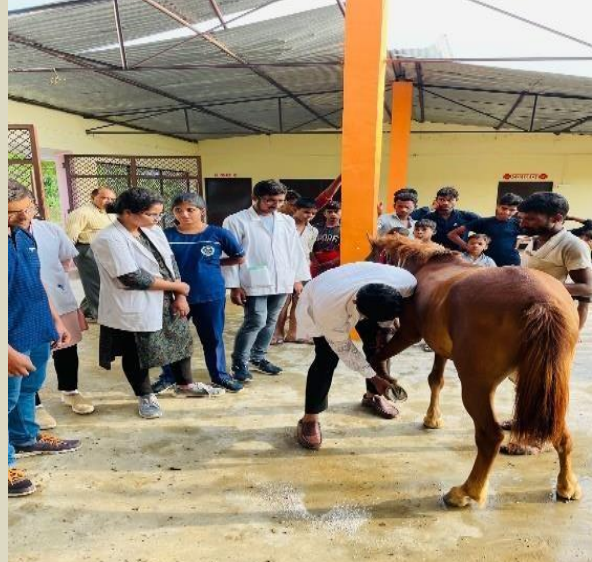
Students attending clinical case at clinical camp under Veterinary Clinical Practice course on 21.10.2020