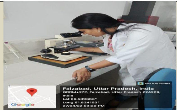
Students learning microbiological techniques in microbiology lab on 27.04.22