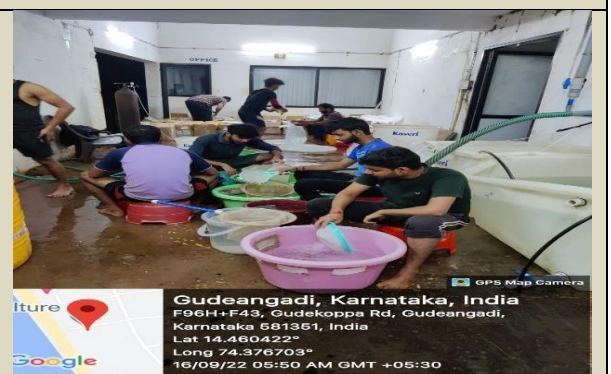
Students working at marine finfish hatchery, Karnataka on 16.09.22