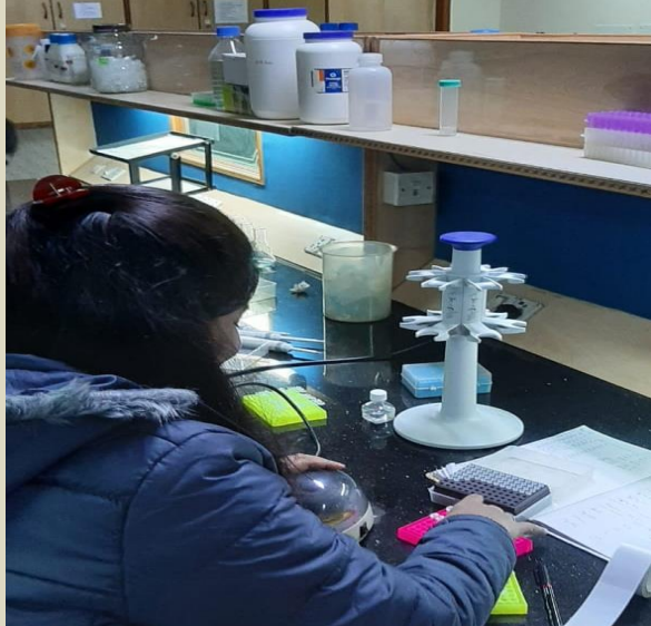
Student working in central instrumentation lab for research work on 12.10.22