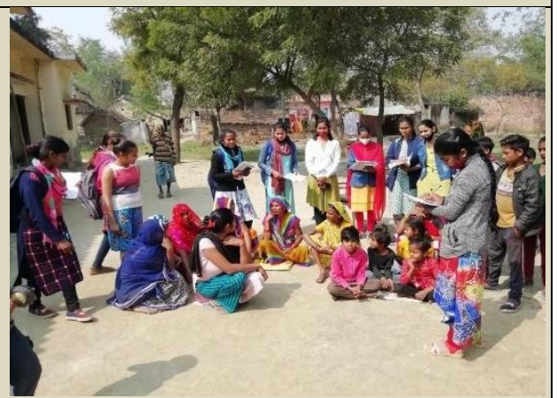
Students working in village under course Rural Agricultural Work Experience (RAWE) on 13.11.2018