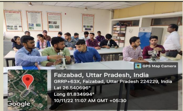
Observing the fungal culture in Plant Pathology Lab on 10.11.22