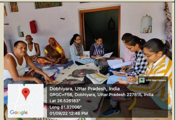
Students of community science working under course RAWE on 01.09.22