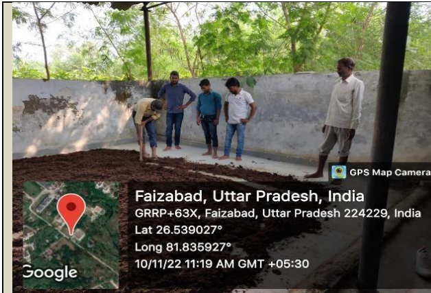
Students learning to remove excess moisture from mushroom compost in Mushroom Production unit on 10.11.22