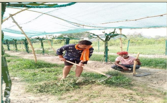
Ph.D students preparing field for production of dragon fruit on 15.10.2021